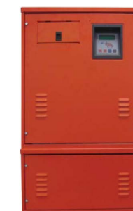
Myers EM Series 1ph Central Lighting Inverter