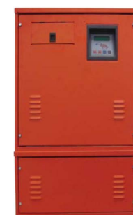
Myers EM Series 1ph Central Lighting Inverter